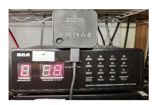
Picture 2 RCA VH226E Rotator Box. Sitting on top is the IR hub, it hangs out in front of the rotator box about 6 inches away, just on top of box for the picture.