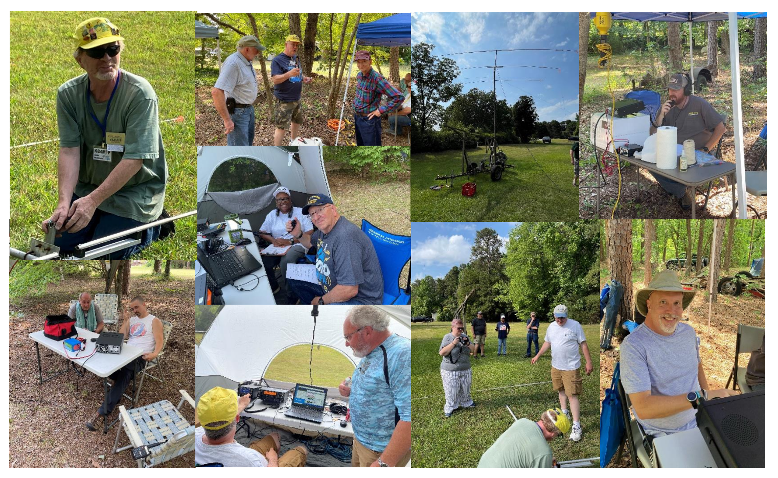
HPARC JULY CALENDAR