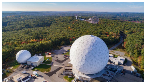
The MIT Haystack Observatory in Westford, Massachusetts.

"If you were to go to an electrical engineering class, that's what you would see as the edge of how to pack information into a very small bandwidth. I enjoy pointing that out to people and getting them to understand that this other modulation mode is just one of the other palettes that are available."