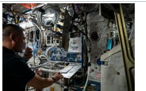
NASA Astronaut Kjell Lindgren, KO5MOS, participates in ARRL Field Day 2022 aboard the International Space Station.

The ARRL Teachers Institute on Wireless Technology is a donor-