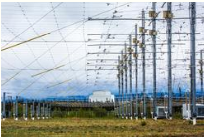
The High-frequency Active Auroral Research Program (HAARP) facility in Alaska.

concurrently be conducting an HF ocean scatter experiment. Actual transmit days and times are highly variable based on real-time ionospheric conditions and the Poker Flat Research Range launch window. The following schedule is subject to change, and all transmissions will take place on 6.8 MHz.